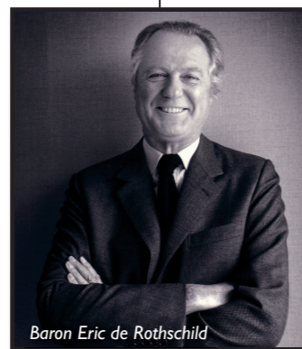
Baron Eric de Rothschild

« We wanted to extend our 'savoir faire' and expertise abroad. Chile was known in the past as a place where one had made good wines and the non existence of the phylloxera bug made us investigate this country in priority. We made a thorough surveying of many Chilean vineyards. 'Los Vascos' vineyard (whose name means 'the Basques' – a tribute to the first owners'