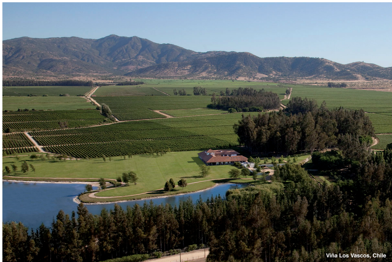
Viña Los Vascos, Chile